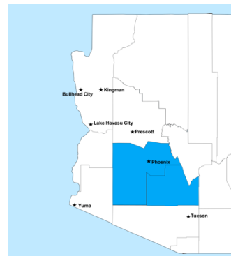
● Current Footprint