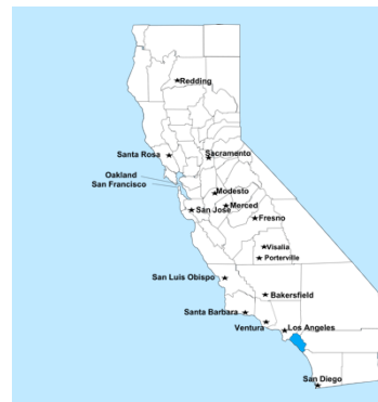
● Current Footprint