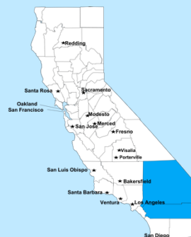
● Current Footprint