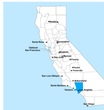
● Current Footprint