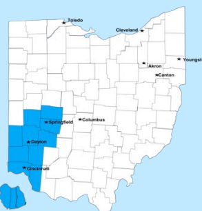
● Current Footprint